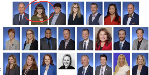
Congratulations to the Class of 2020!